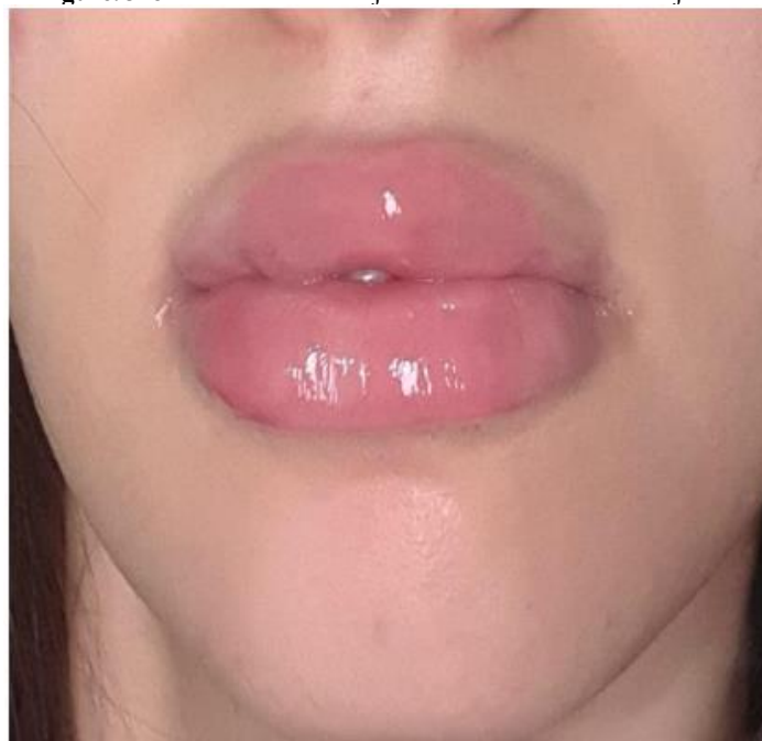
Figure 4: 24 hours after vaccine injection