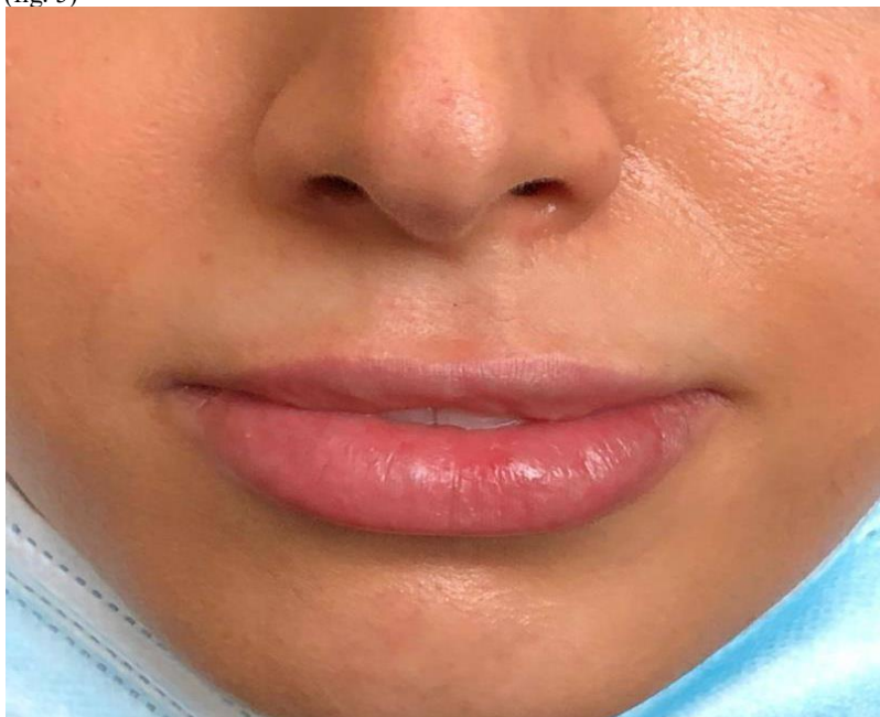
Figure. 1: Before filler injection

The patient underwent 7 days of cetirizine (10 mg, every 12 hours) with minimal to no improvement in her condition. After these 7 days, we started 25 mg of prednisolone (0.5mg/kg) per day (10 mg first dose, then 5mg every 8 hours for two days), for this patient. After the first dose, the patient showed remarkable signs of improvement, so we reduced the dose to 15 mg per day for another 24 hours and the swelling, nodularity, and the sensation of burning completely subsided. (fig. 5)