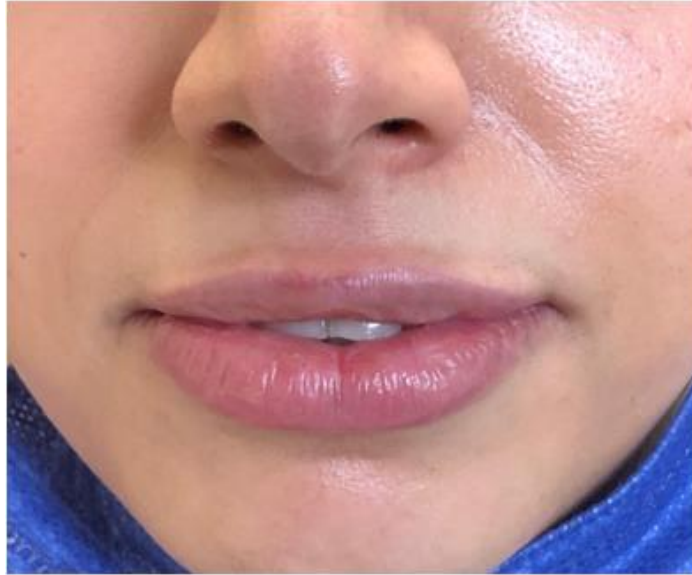
Figure. 2: After filler injection