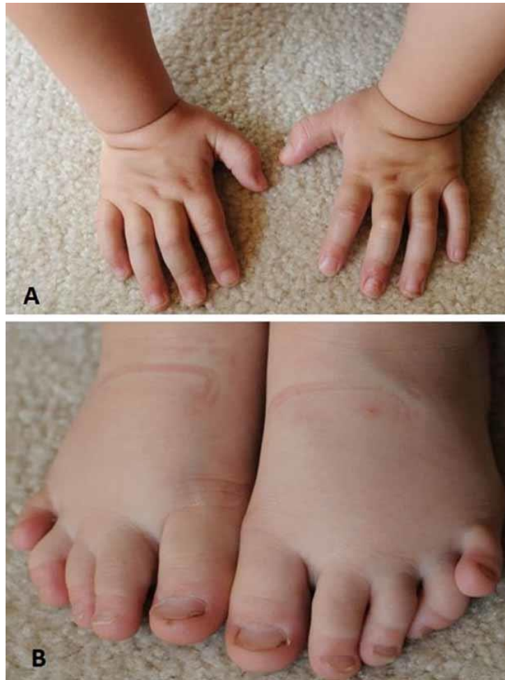
Figure 1: Image of the hands and feet of a child with chromosome 4q deletion syndrome. 1