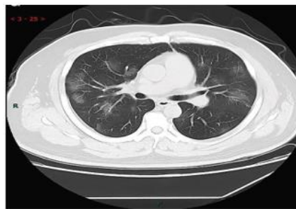
Figure 1. CT image of 38 years old male with fever (39.3°C), dry cough and shortness of breath for 3 days (adopted from Y. H. Jin et al., 2020 [1]).

patchy, multiple, and/or large patches of consolidation in lungs along with a honeycomb-shaped interlobular septal thickening or little grid-like in the lower and middle lobes.