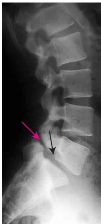
Figure 2: spondylolisthesis