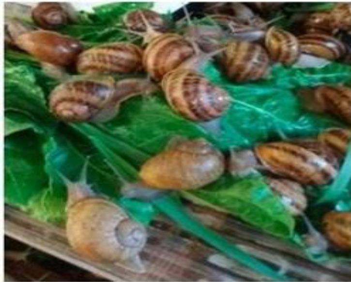
Figure 3: Specimen of Helix aspersa Müller. Microbiological investigations