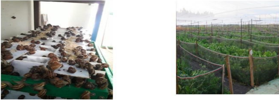
Figure 2: (On the left picture) Indoor breeding snail farm with cells systems, (On the right) outdoor natural snail farm bounded by nets.