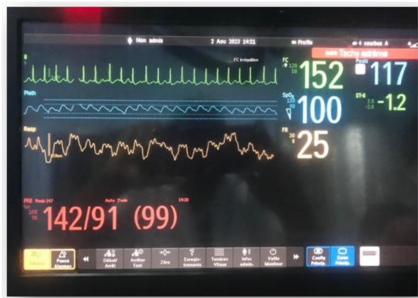
Figure 3: Arriving In the operating room, the patient presented with tachycardia with a heart rate of 125 on the monitor

Upon arrival in the operating room, the patient presented with tachycardia with a heart rate of 125 - 130 beats per minute (BPM), ( Figure 3 ) and the ECG confirmed the presence of atrial fibrillation with an absence of P waves. Other vital signs, including blood pressure (125/78 mmHg) and oxygen saturation (97%) at room air, were normal. In consultation with the gastroenterologist, it was decided to postpone the colonoscopy procedure and await further cardiac evaluation.