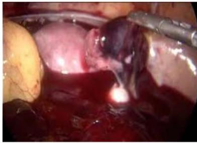
Figure 1: Retroperitoneal hemoperitoneum

of the dorsal superior pancreatic artery, this branch is ligated, thus stopping the bleeding, thus concluding the surgery. Despite the blood loss, the patient remained stable during surgery and in the recovery room, for which he was transferred to the Surgery room where he evolved favorably and was discharged on the 5th day.