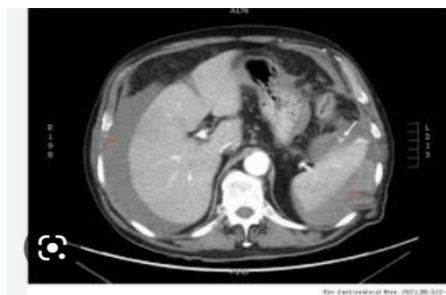
Figure 4: Vision of the Multislice CT carried out. Vision of the Multislice CT carried out.