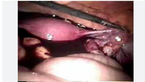
Figure 2: Hemoperitoneum Found