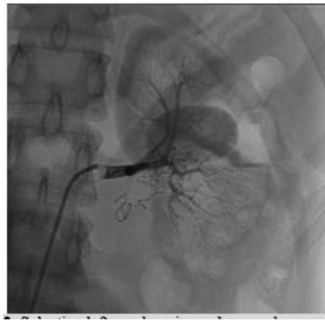
Figure 2: Selective left renal angiography was done and suggested pseudoaneurysm at the proximal inferior branch of the Left renal artery

Selective left renal angiography was done and suggested pseudoaneurysm at the proximal inferior branch of the left renal artery. We inserted a vascular plug 6x7 mm and deployed at the proximal inferior branch of the left renal artery (Figure. 2,3). There were no complications of endovascular treatment.