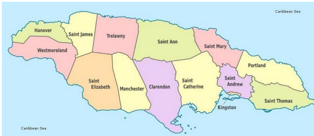
Figure 1. Map of Jamaica showing all the parishes

Data was obtained from the Jamaica Cancer Registry located in the Pathology Department of the University of the West Indies. The methodology of the registry has been previously stated. [4-5] Cases are registered from information gleaned from public and private hospitals and general practitioners in Kingston and St. Andrew then verified by pathologists at Jamaica Cancer Registry in accordance with standard techniques of registration.[6]